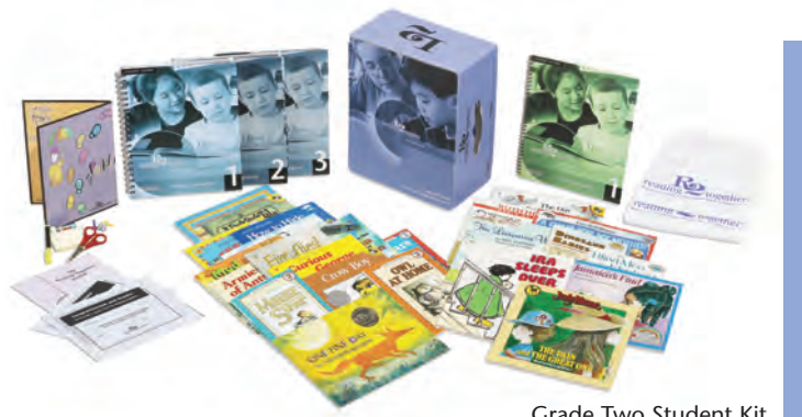
Grade Two Student Kit

For more information, contact: The Learning Together Company 5509-B W. Friendly Avenue, Suite 201 Greensboro, North Carolina 27410 www.learningtogether.com Toll-free 1.866.921.0000